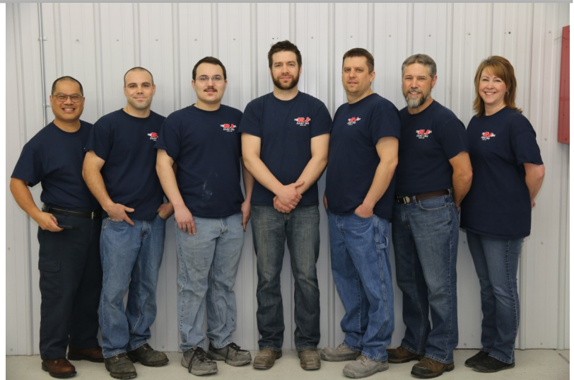
RJ Cars Crew

Behind every restoration project, collision repair, and mechanical repair done here at RJ CARS INC is a team of people who care about the quality, service, cleanliness, and attention to detail you receive on each job, big or small. My hats off to all of our staff for consistently providing their best to our clients! You can check out each of our Team members and much more at the all new RJCARS.COM website!